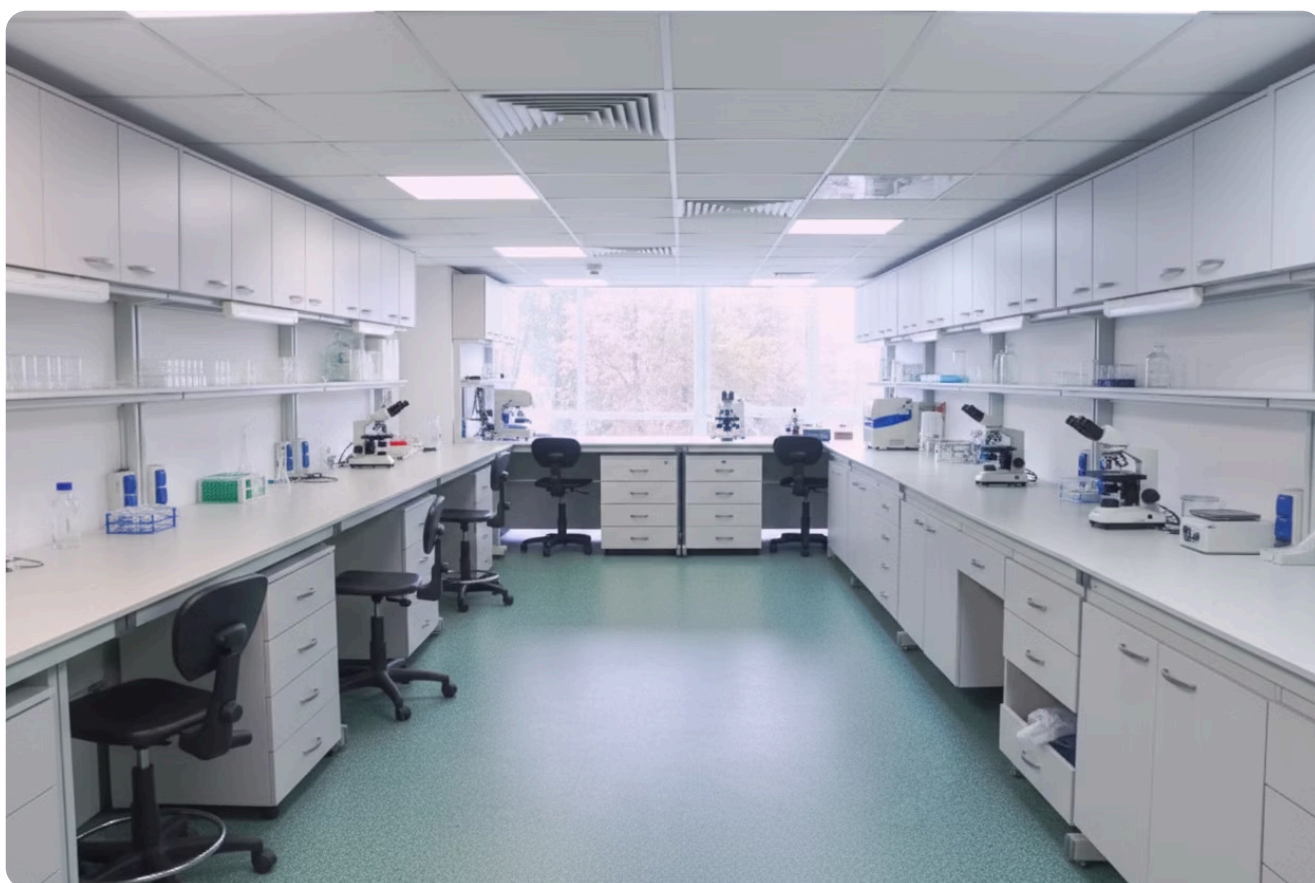
Figure 1: Modern research laboratory equipped with advanced microscopy equipment.