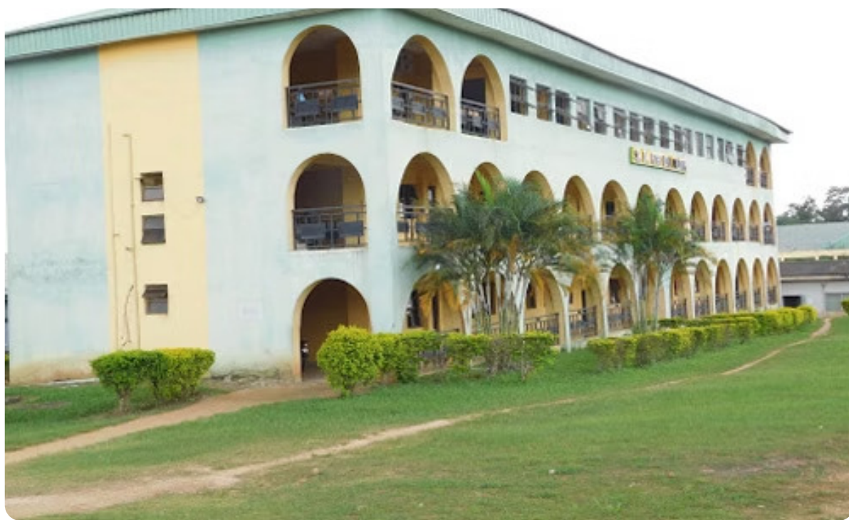
Figure 3: ICT certification centre