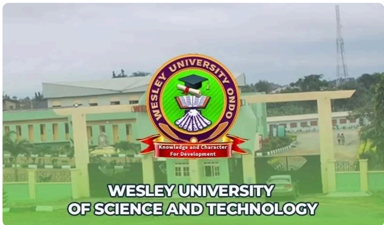
Figure 2: Modern infrastructural development