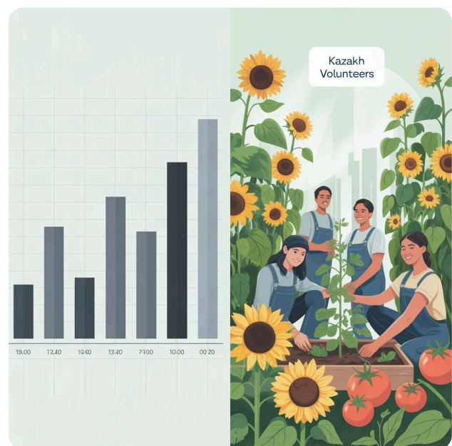
Figure 2. Contrasting evaluation approaches: quantitative metrics versus qualitative community impact

Working with volunteer communities in Central Asia, I see how quantitative metrics miss the most valuable aspect - deep social transformations that resist numerical measurement. This reflects a fundamental gap between Global North and South knowledge systems. International organizations apply Western evaluation standards that overlook key aspects like the quality of social connections, cultural transformations, and intergenerational knowledge transfer. (Figure 2).