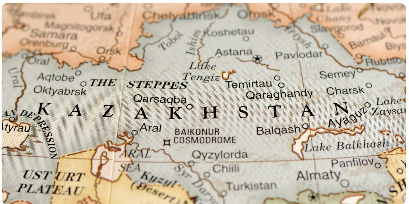
Figure 3. Collaborative future: Kazakhstan's intergenerational volunteer movement building sustainable communities

The experience of Kazakhstan's volunteer movement clearly shows: we should reconsider viewing the Global South primarily as a space for implementing ready-made solutions. Contemporary donor practices continue to prioritize standardized Western models, creating barriers for local participants and undermining traditional mutual aid practices like asar . Research on mutual aid organizing demonstrates that community-led responses offer crucial lessons for formal sectors serving marginalized communities (Wu et al., 2025). This approach perpetuates the assumption that Global South contexts must adapt to Northern standards rather than developing culturally-grounded alternatives. Central Asia suggests that the future of sustainable development may require not only new approaches but also a new understanding of local communities' role in creating them. When volunteers act not just as implementers but as equal participants in shaping knowledge and practices, a living dialogue emerges between tradition and modernity, capable of enriching global social transformation practices. This experience points toward new possibilities for reframing relationships in both development practice and academic knowledge production, where local communities become co-creators rather than recipients of expertise. (Figure 3).